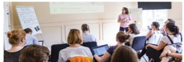
The Social Dimension of Erasmus+ Conference | Brussels | 14 & 15 October 2019

The ' Social Dimension of Erasmus+ ' conference will address how the Erasmus+ programme encourages a more connected and inclusive society through initiatives that promote social engagement and volunteering on exchange.