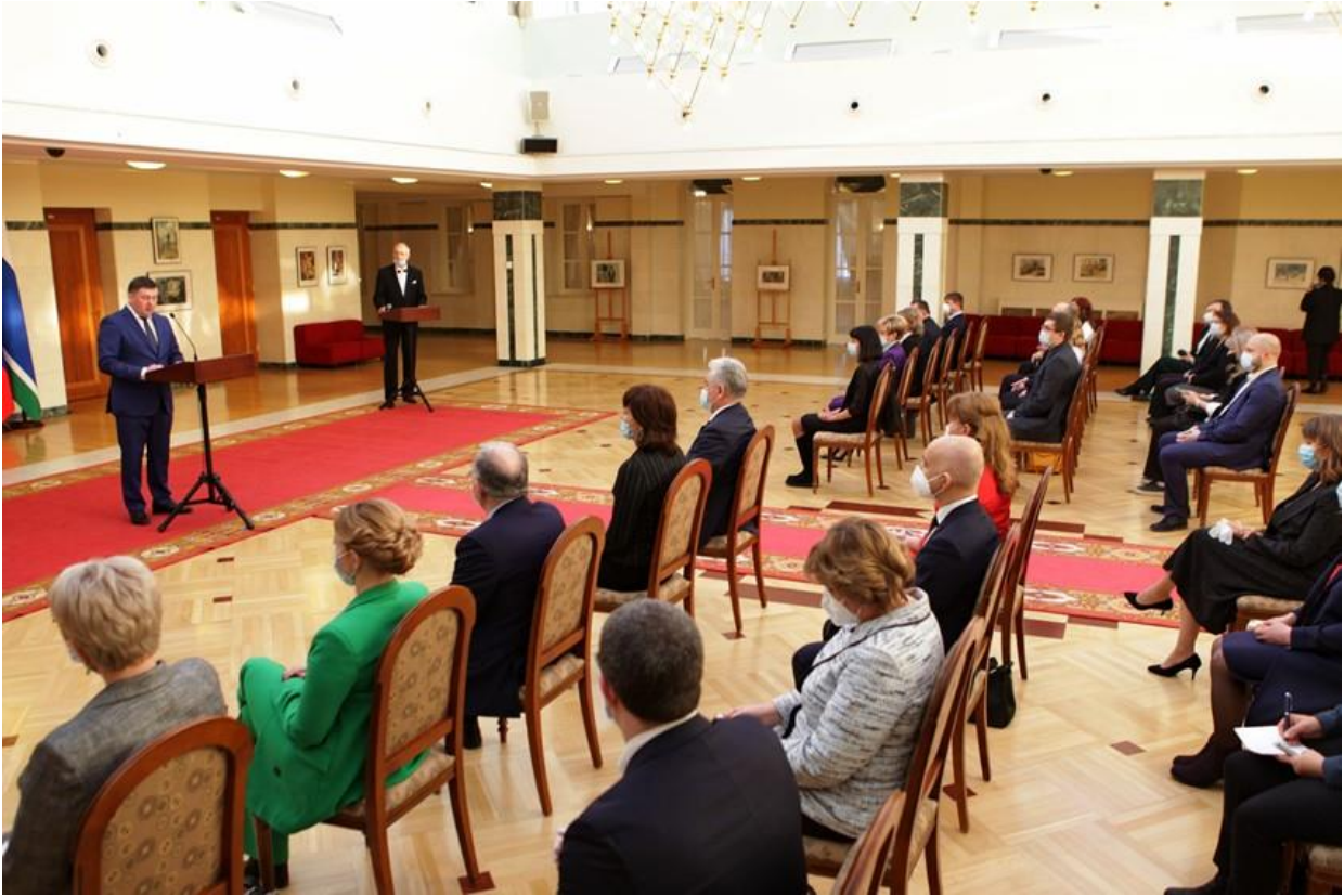
Photos taken at the Governor's Prizes

The strategic goal of the development of the university is the formation of a Russian scientific, educational and innovative center of international level on the territory of the Ural Federal District. UrFU is called upon to become the core of this center.