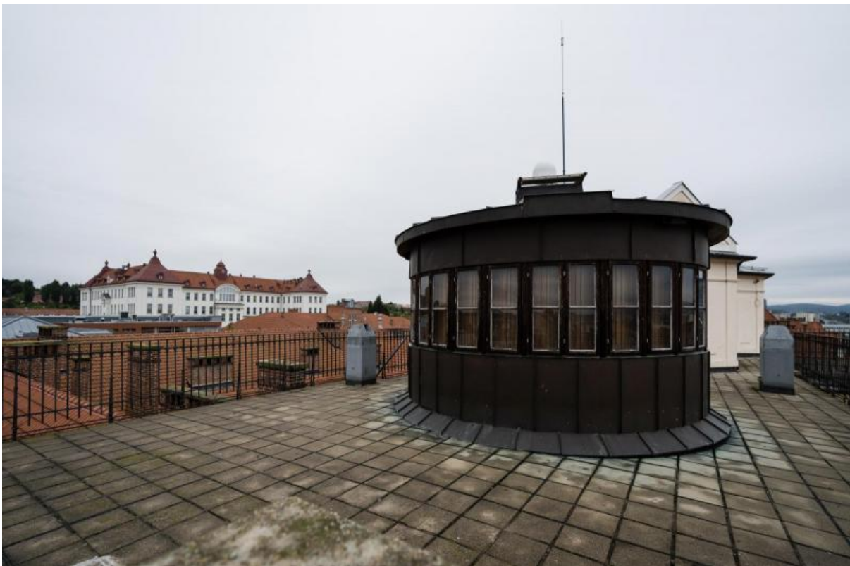
The TUBO station is celebrating 20 years of operation this autumn, but geodesy has been taught at BUT for more than a century

You will find geodesy all around us, not only in the mountains, but especially in the Cadastre of Real Estate and on construction sites. Positioning data help, for example, with more accurate drone navigation, in determining the correct shape or axis of elevator shafts in high-rise buildings and much more. "We map caves with the help of scanners in speleology and we prepare materials for information models of buildings. There is also geodetic astronomy, which in turn determines the astronomical coordinates and deviations of the verticals. After all, our astronomical observatory was such the first basis for the establishment of today's Brno Observatory. So you can apply geodesy from the underground all the way up to the space," Bureš described the wide range of surveyors.