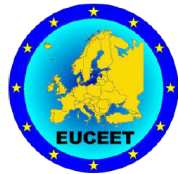
European Civil Engineering Education and Training Association