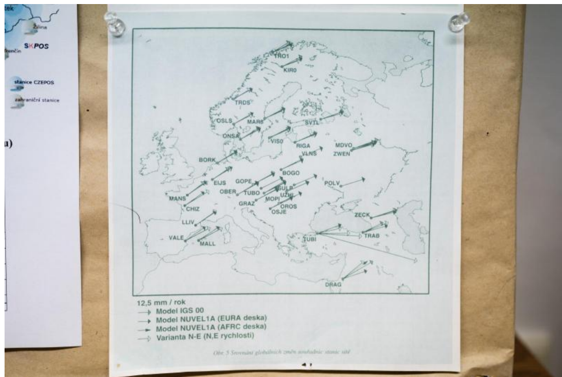
The fixed station helps surveyors to monitor, for example, the movement of the Earth’s plates

Today, virtually everyone has their own small GPS station, either on their mobile phone or in their car. However, these mobile devices do not normally have sufficiently accurate physical and mathematical corrections for satellite data, so they will target a person or a car with maximum accuracy of several metres. Millimetre-accurate data from permanent stations is still needed. “Surveyors first researched the method itself, increasing the accuracy of the technology, but GPS coordinates are now a common part of almost every phone. Therefore, we are moving towards new uses of localisation, for example in smart agriculture, construction 4.0 or smart production plants. Sensors are now much more accessible, the number of coordinate recipients has increased and data transmission has accelerated. Today, the exact location helps, for example, in the collection of geodata for digital technical maps and drawings in construction, as well as for many other purposes,” said Jiří Bureš, who, together with other colleagues, ensures the smooth operation of the station.