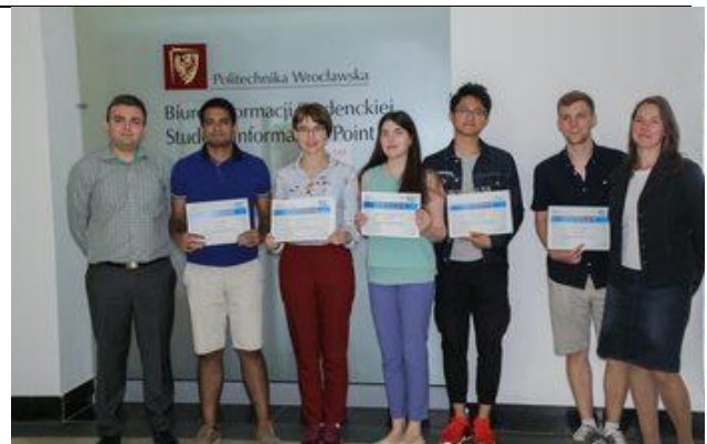
Participants at the summer schools