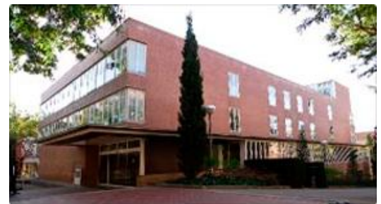
Barcelona School of Civil Engineering

Barcelona School of Civil Engineering (ETSECCPB) Technical University of Catalonia, BarcelonaTech C / Jordi Girona 1-3, C2 08034-Barcelona, SPAIN