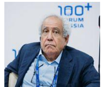
Some photos OF THE EUCEET Association representatives taken at the Forum 100+ Russia Ekaterinburg, 5 th October 2017