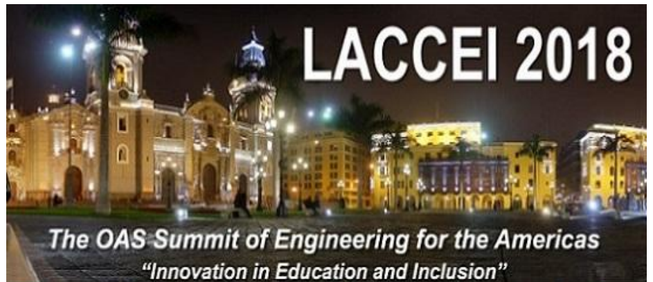
16th LACCEI International Multi-Conference for Engineering, Education, and Technology Lima, Peru - July, 2018

LACCEI is a non-profit organization of Latin American and Caribbean (LAC) institutions that offer academic programs in Engineering and Technology as well as institutions (i.e. universities, colleges, schools and businesses) from other parts of the world that have demonstrated interest and activities with LAC institutions.