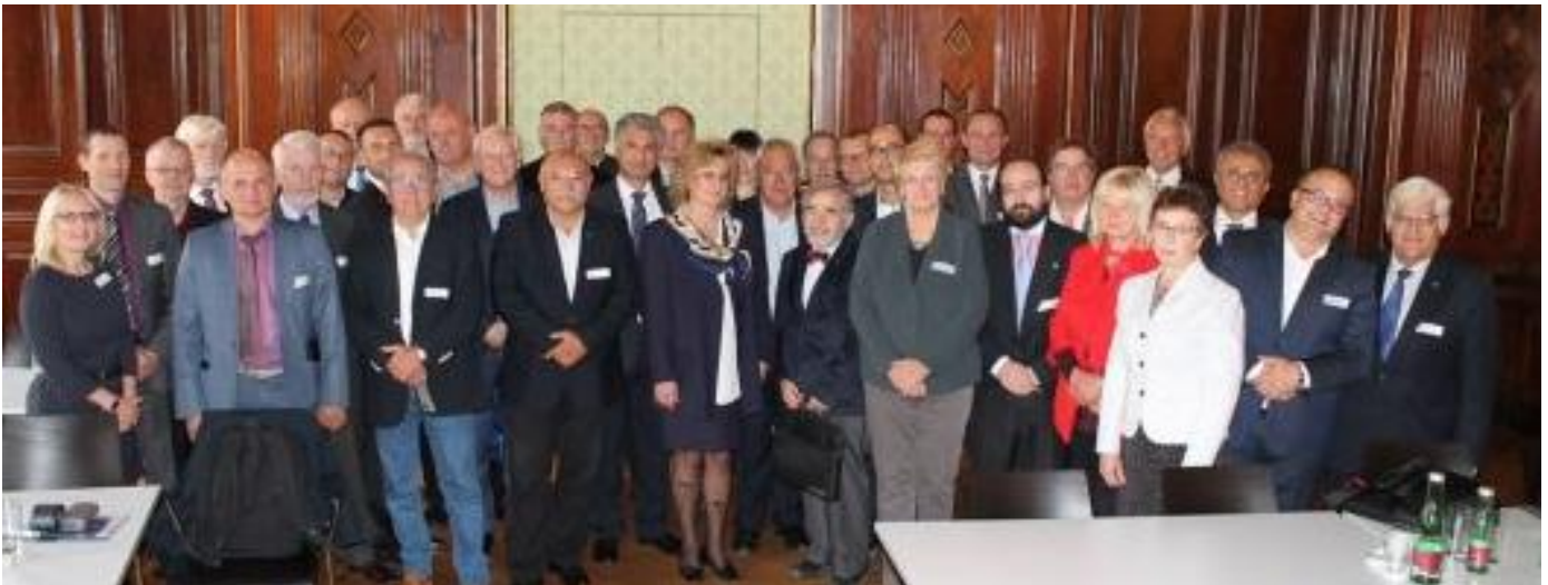
66 th ECCE General Meeting group photo

On 3 October, the ECCE Executive Board meeting was held.