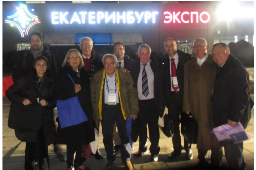
Group photo taken at the International Exhibition Center "Ekaterinburg-EXPO" which hosted the 10 th General Assembly of the Association

At the meeting were discussed matters related to the activity of the Association between the GA held in Cluj-Napoca on 29 th September 2016 and 5 th October 2017, and were defined the lines of the activity in 2018. A central point was the discussion concerning the organization of the 4 th Conference of the Association to be held in September 2018 in Barcelona.